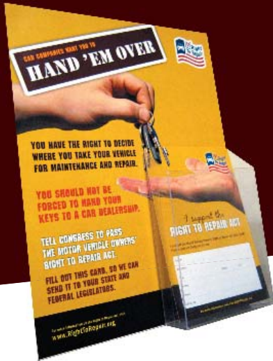
Display Size: 8.5" x 11"